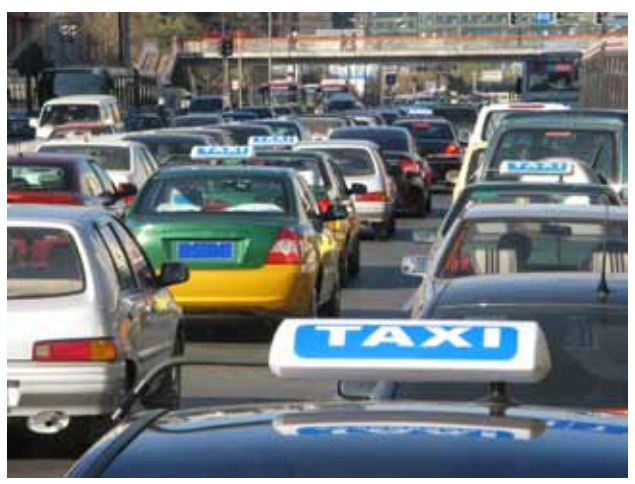
HBEFA China can calculate emission impacts of traffic congestion

It is feasible to design effective measures for less polluting urban transport systems. This requires, however, understanding of the drivers of emissions i.e. which vehicles are on city roads, which and how much fuel do cars and buses consume, in what traffic situations vehicles emit less than in others and accumulating data on the total kilometres travelled by each vehicle type.