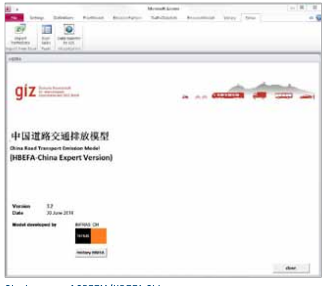
Start screen of CRTEM/HBEFA China

stop-and-go traffic. Almost non-existent in Europe, heavy stop-and-go situations make up 5 - 10% of urban traffic in China's large metropolises. This matters because cars emit significantly more in highly congested traffic – up to three times more than in free flow situations.